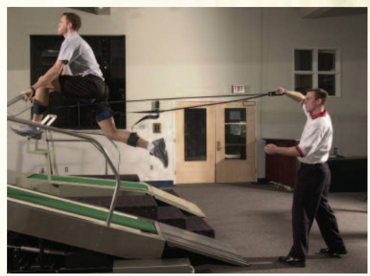
Athletic Republic<sup>™</sup> sports performance enhancement training

• Services range from nonsurgical and minimally invasive procedures to surgery and rehabilitation for muscle, joint and bone injuries and abnormalities