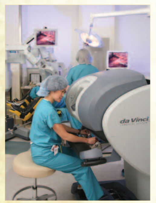
Gynecology/Oncology surgery using the daVinci robot

For physician referral, call 281.364.5959 or visit memorialhermann.org