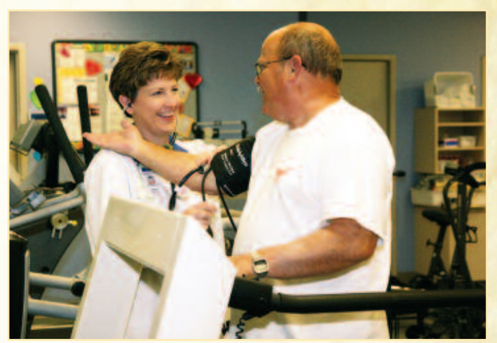
A Cardiac Rehab nurse monitoring blood pressure during exercise